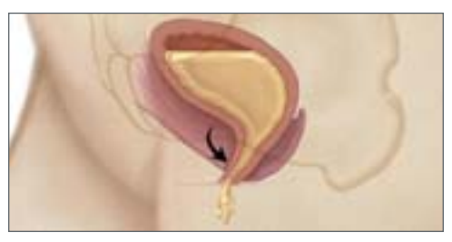
FIGURE 2: A weakening of the muscles supporting the urethra causes the urethra to drop during physical activity, resulting in urine leaking.